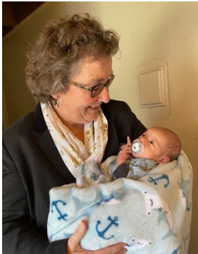
Our newest addition 😊